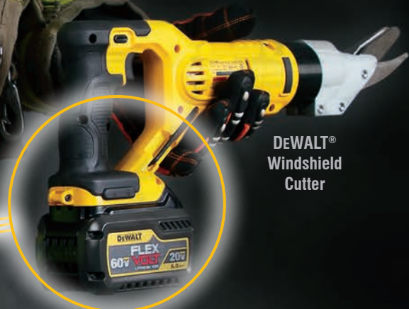
DEWALT® Windshield Cutter