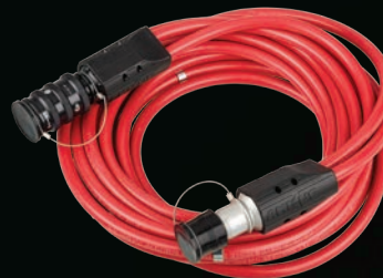
Extension Hose Red with Mono Couplings Both Ends