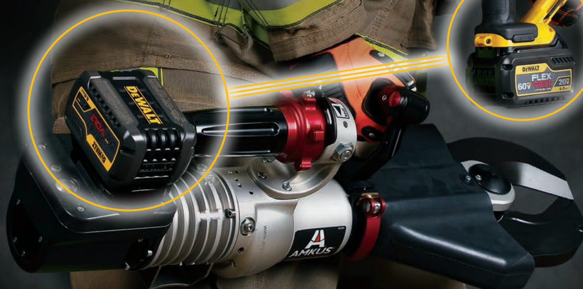
AMKUS ION iC550 Cutter